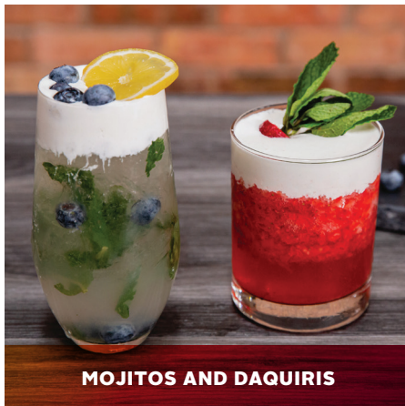
MOJITOS AND DAQUIRIS