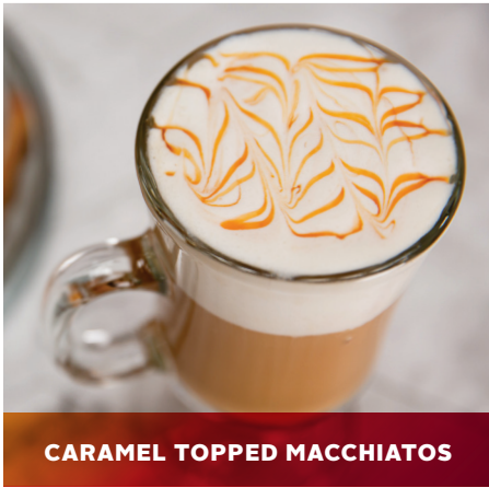
CARAMEL TOPPED MACCHIATOS

CAPITALIZE ON THE COLD FOAM CRAZE TO TRANSFORM COFFEES, SODAS, COLD BREWS, SLUSHIES AND MORE FROM 'MAYBES' INTO 'MUST-HAVES.' ADD FLAVORS, COLORS AND PARTICULATES FOR ENDLESS CUSTOMIZATIONS.