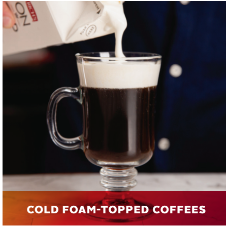
COLD FOAM-TOPPED COFFEES