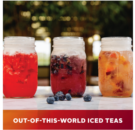
OUT-OF-THIS-WORLD ICED TEAS