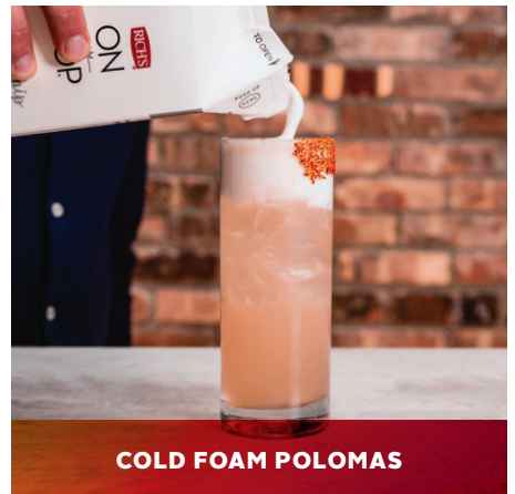
COLD FOAM POLOMAS