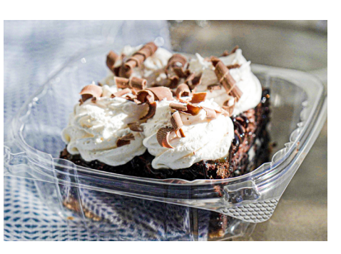
From beverages to desserts, use On Top with confidence on both hot and cold applications.

On Top's stability delights consumers by arriving picture perfect — even after 30 minutes or more.