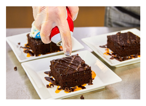
Close contact where product dispenses means potential contamination with every Aerosol use.

Aerosol quickly liquifies and muddles atop hot desserts.