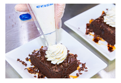
On Top's no-touch dispensing prevents contamination.