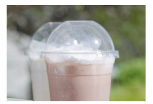
Sunken and deflated in just minutes, Aerosol delivers only disappointment.