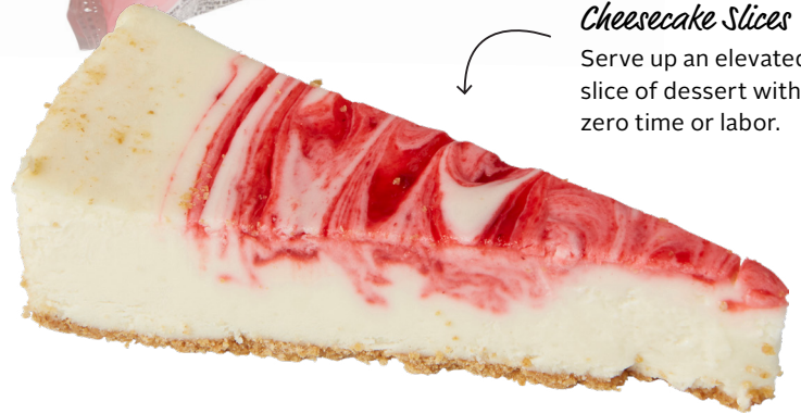
Cheesecake Slices Serve up an elevated slice of dessert with zero time or labor.