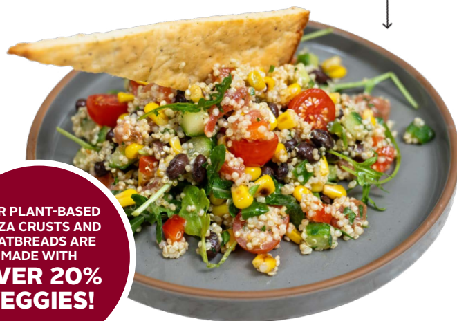
Veggie Quinoa Bowl with 12" X 5" Gluten-Free Seasoned Cauliflower Flatbread (PC 22424)

OUR PLANT-BASED PIZZA CRUSTS AND FLATBREADS ARE MADE WITH OVER 20% VEGGIES!