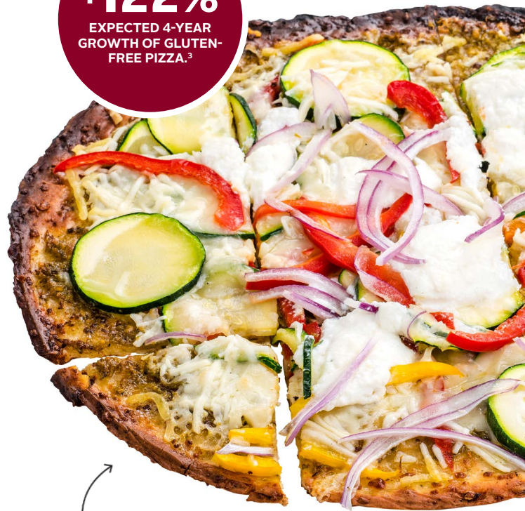
Roasted Veggie Pizza on 10" Gluten-Free Seasoned Cauliflower Pizza Crust (PC 11819)

+122% EXPECTED 4-YEAR GROWTH OF GLUTEN- FREE PIZZA. 3