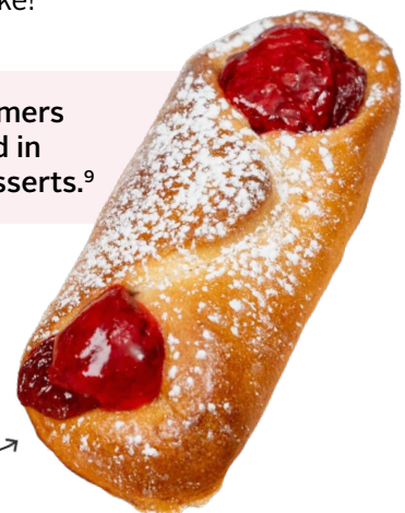
Fruit-Filled Kolache with Whole Grain Rich Sweet Hawaiian Roll Dough (PC 16206)

US consumers interested in global desserts. 9