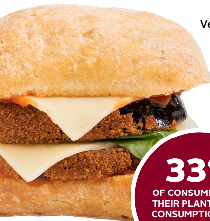
Vegan Eggplant Parm Sandwich on Artisan Cauliflower Ciabatta Roll (PC 21531)

Banh mi has gained +27.05% SOCIAL POPULARITY over the past year. 9