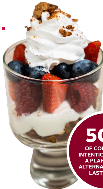
Sunrise Berry Parfait with On Top Oat Milk Whipped Topping (PC 20667) and UBR® Cinnamon Ultimate Breakfast Round (PC 08733)

is the biggest trend in healthcare dining, according to operators. 6