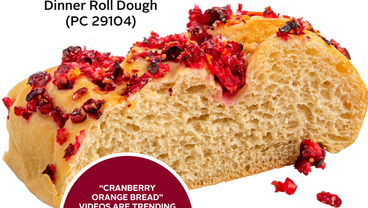
Rustic Cranberry Orange Bread with Simply Sweet Yeasty Dinner Roll Dough (PC 29104)

"CRANBERRY ORANGE BREAD" VIDEOS ARE TRENDING ON TIKTOK WITH 534.2K VIEWS. 3