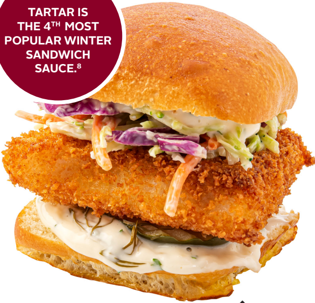
Fish Fillet Sandwich with Simply Sweet Yeasty Dinner Roll Dough (PC 29104)

TARTAR IS THE 4 TH MOST POPULAR WINTER SANDWICH SAUCE. 8