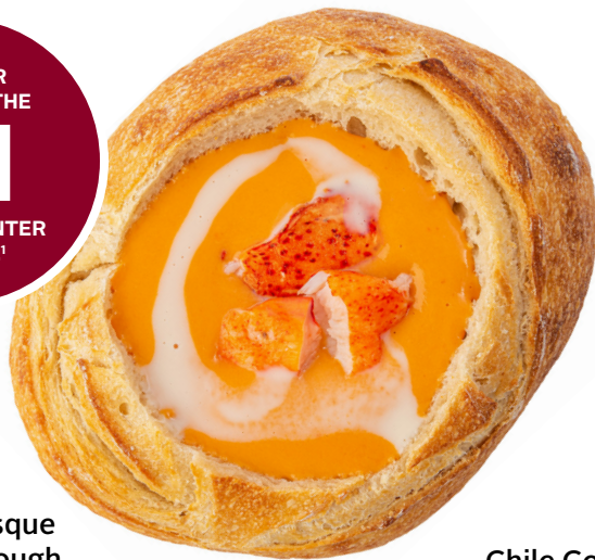
Lobster Bisque with Sourdough Artisan Boule (PC 18774)

LOBSTER CREAM IS THE #1 SAVORY WINTER FLAVOR. 1