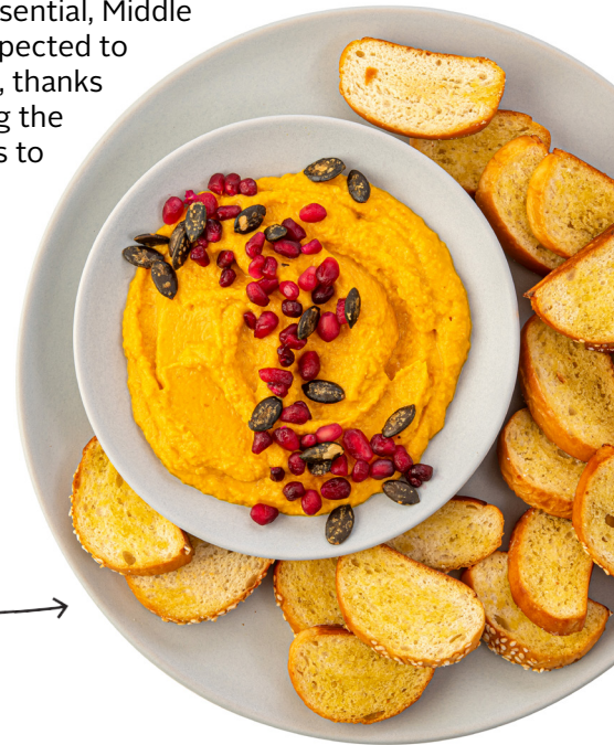
Winter Harvest Hummus Appetizer with Simply Proof & Bake Parkerhouse Roll Dough (PC 29399)

According to Datassential, Middle Eastern dips are expected to gain menu demand, thanks to hummus opening the door for consumers to try other dips from the region. Add colorful winter flavors and fruits, like pomegranate, for a seasonal spin.