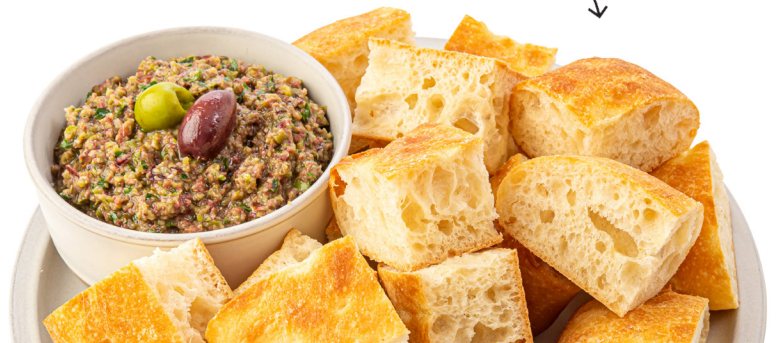
Tapenade Focaccia with Extra Virgin Olive Oil Artisan Focaccia Bread (PC 22586)

Tapenade is expected to see +15% 12-month growth on menus. 7