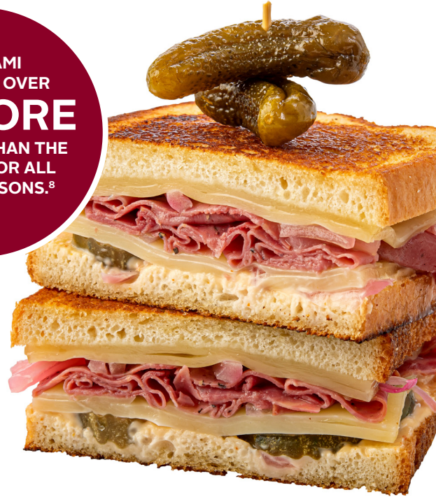
Pastrami Melt with Spicy Aioli with Italian Panini Bread (PC 15607)

PASTRAMI IS MENUED OVER 3X MORE IN WINTER THAN THE AVERAGE FOR ALL OTHER SEASONS. 8