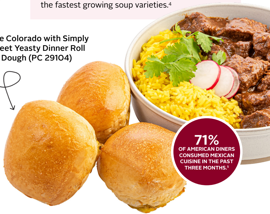
Chile Colorado with Simply Sweet Yeasty Dinner Roll Dough (PC 29104)

71% OF AMERICAN DINERS CONSUMED MEXICAN CUISINE IN THE PAST THREE MONTHS. 5