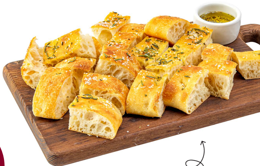
Focaccia Appetizer with Dip and Herbs Extra Virgin Olive Oil Artisan Focaccia Bread (PC 22586)

27% of consumers like or love focaccia. 3