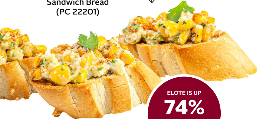
Elote Bruschetta on 7.5" French Long Sandwich Bread (PC 22201)

ELOTE IS UP 74% ON MENUS OVERALL OVER THE PAST 4 YEARS. 1