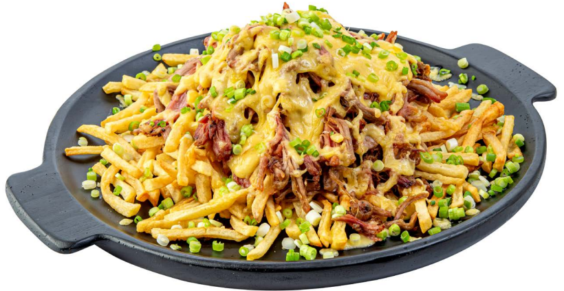
Loaded Fries with BBQ Pork and Smoked Gouda topped with Hickory Smoked Pulled Bar-B-Q Seasoned Pork (PC 09067)

Few foods signal summertime like cooking on the grill. Warm weather triggers cravings for BBQ, and you can feed the need with numerous protein, sauce and prep combinations.