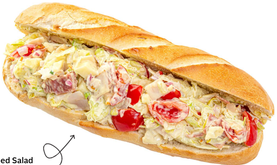
Chopped Salad Sandwich on 7.5" French Long Sandwich Bread (PC 22201)

Chopped Salad Sandwiches WENT VIRAL ON TIKTOK starting in Fall of 2023.