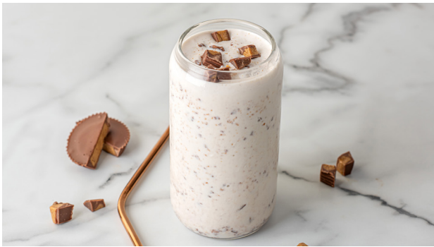
VANILLA + REESE'S® PEANUT BUTTER CUPS