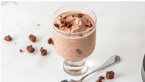
CHOCOLATE + BROWNIE PIECES