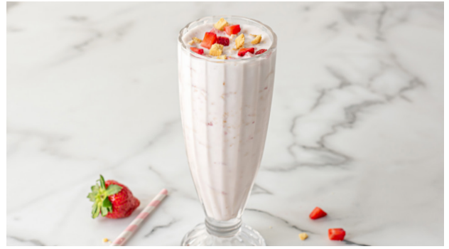
VANILLA + STRAWBERRY JAM OR SYRUP + SHORTBREAD COOKIES