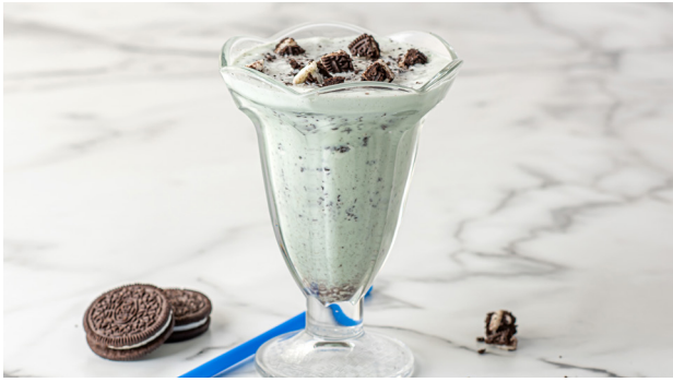
VANILLA + MINT/GREEN SYRUP + OREOS®