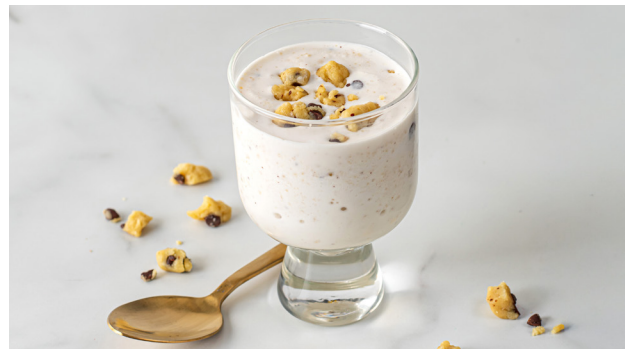
VANILLA + COOKIE DOUGH