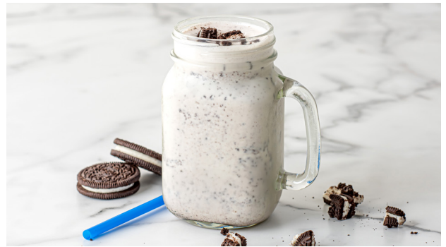
VANILLA + OREOS®